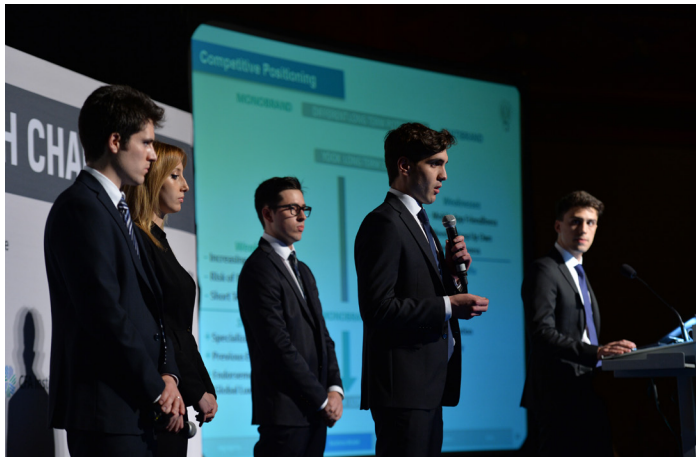
Teams present their research to a panel of industry experts.