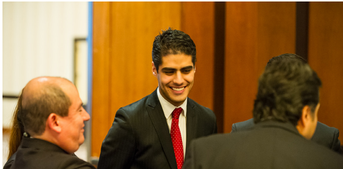
Students build relationships with mentors and have access to professionals working in the industry today.

Each team's findings are locally evaluated by high-profile panels of heads of research, portfolio managers, and chief investment officers from some of the world's top firms. Local champions advance to regional competitions in the Americas, Asia Pacific, and EMEA, and then to the global final.